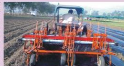
Fig. 4 Laying of plastic mulch on raised beds

Trials were conducted for planting of summer groundnut on raised beds at NRCG, Junagarh and MPKV, Rahuri (Table 4) using tractor operated plastic mulch laying machine (Fig. 4) and tractor operated four row punch planter with modular planting unit (Fig. 5). At both the places, the crop was raised on 0.1 ha area each on raised beds with and without plastic mulch (Fig. 6).